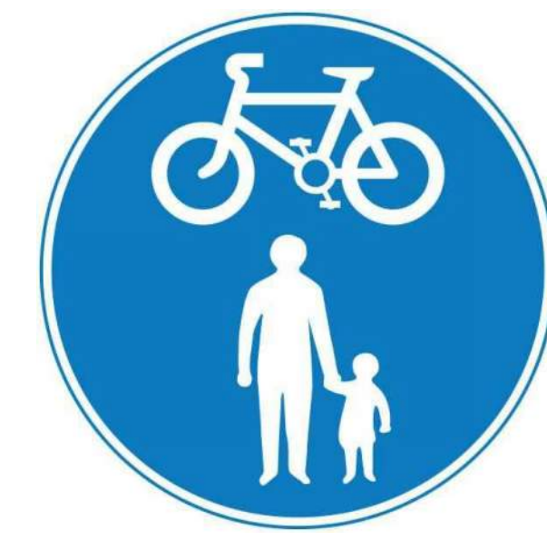
SHARED PEDESTRIAN AND BIKE PATH